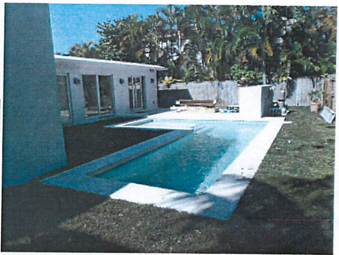
REAR VIEW 11-04-2011