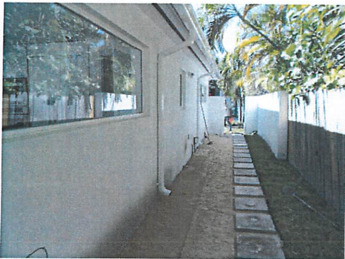
RIGHT SIDE VIEW 11-04-2011