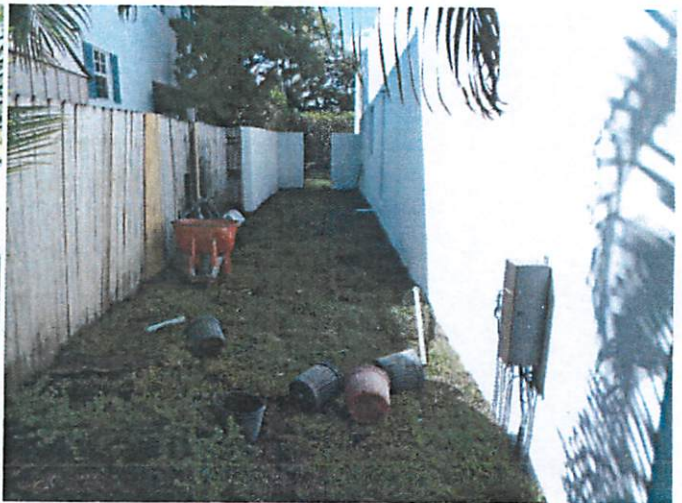
LEFT SIDE VIEW 11-04-2011