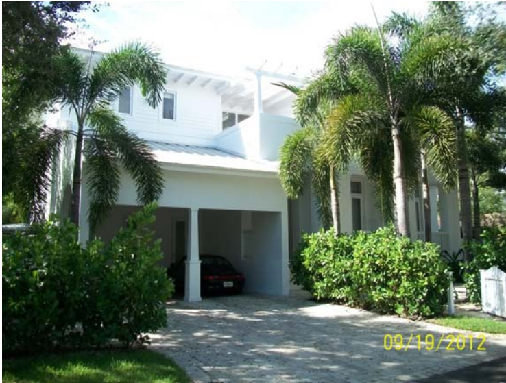
FRONT VIEW : 9-19-2012

If using the Elevation Certificate to obtain NFIP flood insurance, affix at least two building photographs below according to the instructions for Item A6. Identify all photographs with: date taken; "Front View" and "Rear View"; and, if required, "Right Side View" and "Left Side View." If submitting more photographs than will fit on this page, use the Continuation Page on the reverse.