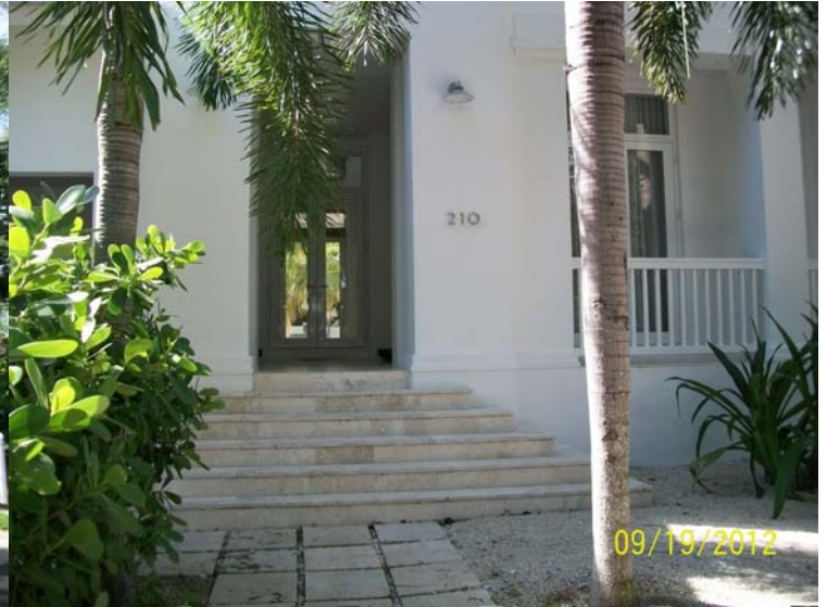
REAR VIEW : 9-19-2012