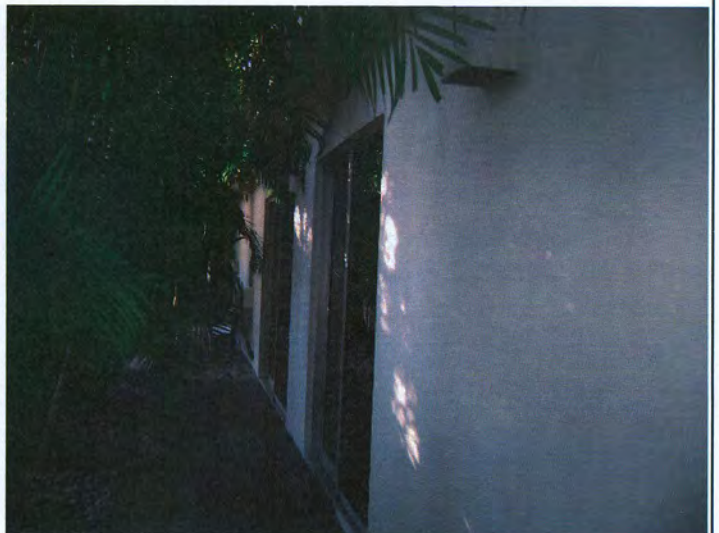
Left Property Picture