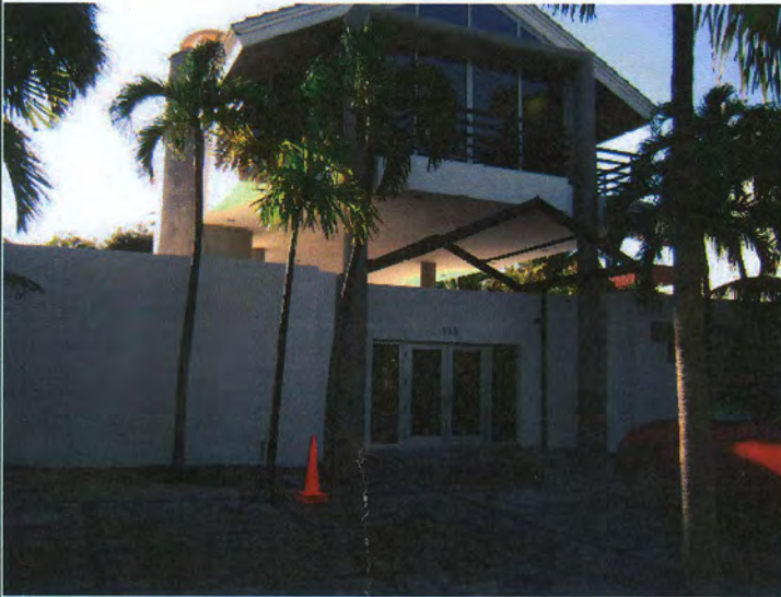
Front Property Picture 11/3/2012

If using the Elevation Certificate to obtain NFIP flood insurance, affix at least two building photographs below according to the instructions for Item A6. Identify all photographs with: date taken; "Front View" and "Rear View"; and, if required, "Right Side View" and "Left Side View." If submitting more photographs than will fit on this page, use the Continuation Page on the reverse.