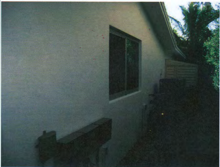
Right Property Picture