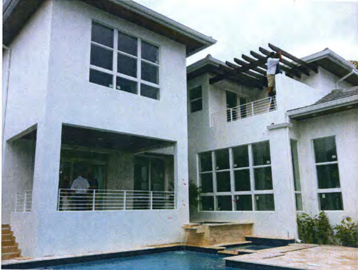
Rear View: 12/28/2012