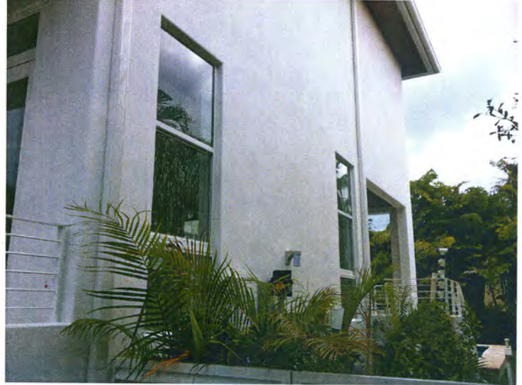
Side View: 12/28/2012