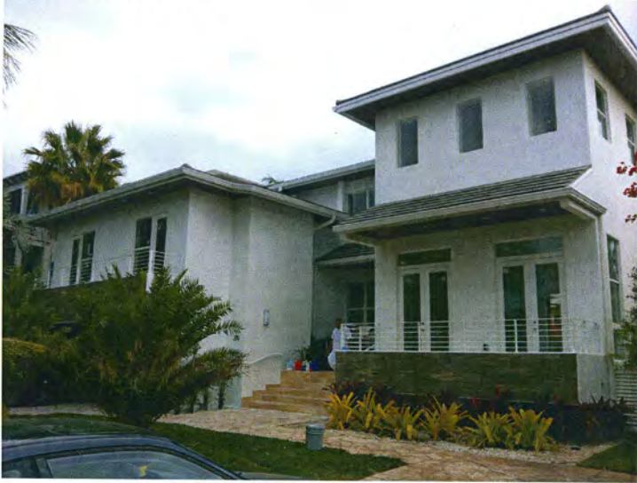
Front View: 12/28/2012