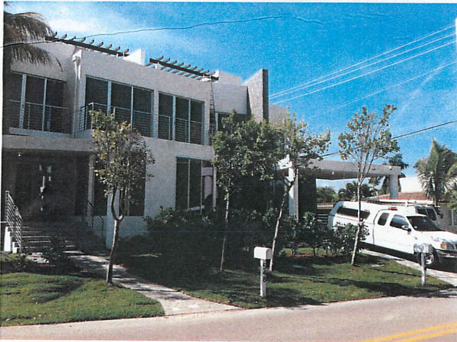
SIDE VIEW -- PHOTOS TAKEN ON 02-23-2012