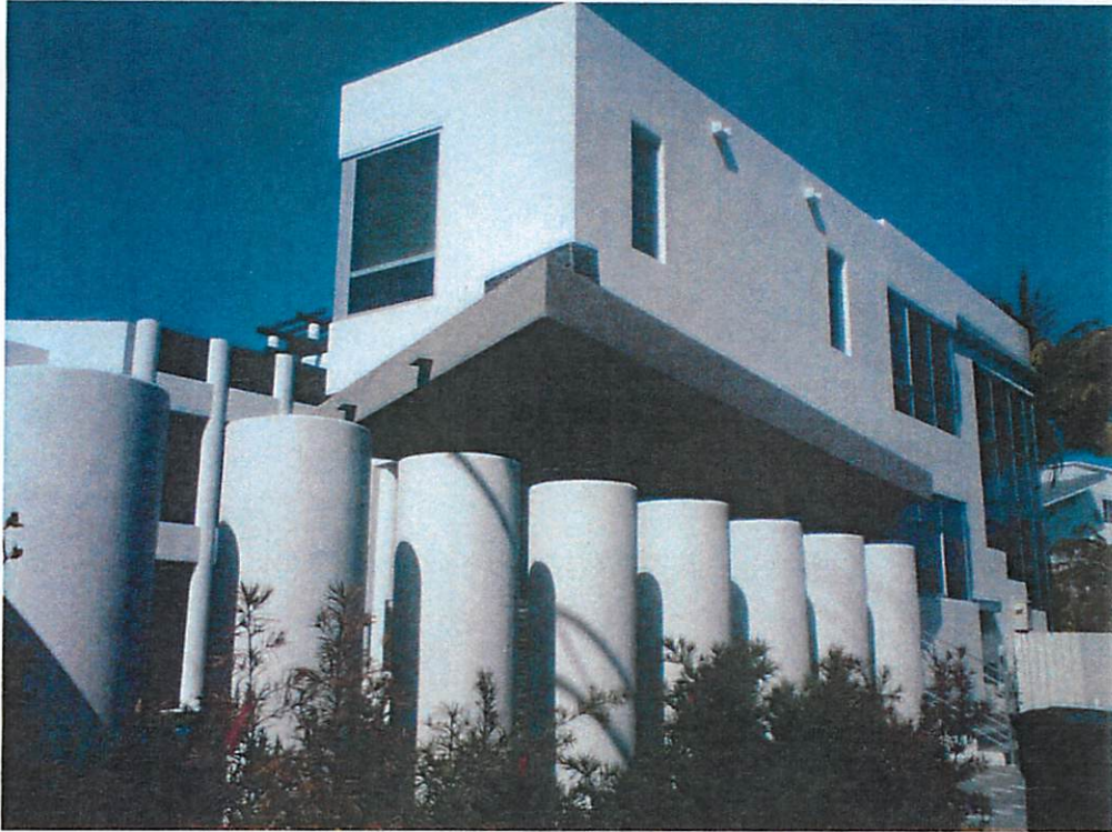
SIDE VIEW -- PHOTOS TAKEN ON 03-31-2012