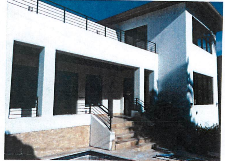
Front View: 09/17/2012