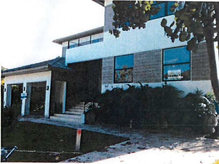
Rear View: 09/17/2012