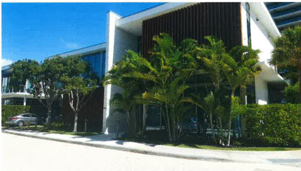
VILLA 1 – WEST LOOKING NORTHEAST 2-20-2019