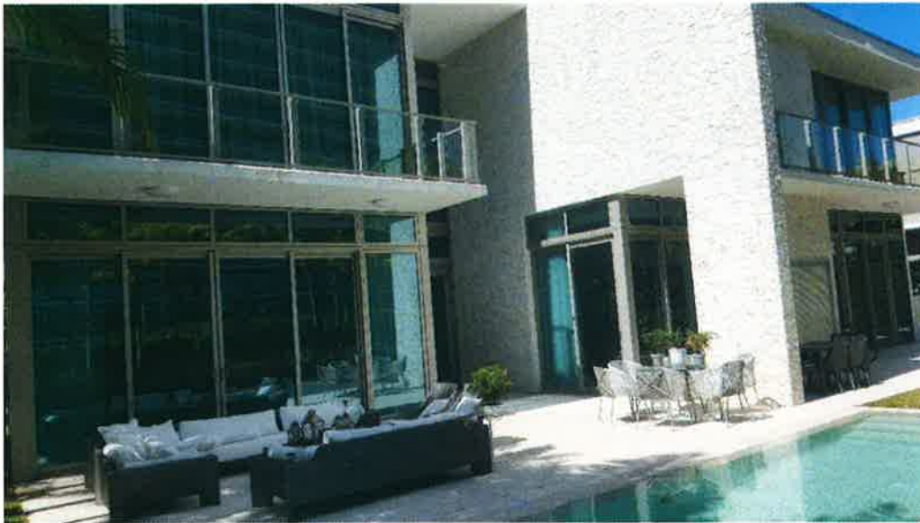
VILLA 1 – EAST LOOKING NORTHWEST 2-20-2019

If using the Elevation Certificate to obtain NFIP flood insurance, affix at least 2 building photographs below according to the instructions for Item A6. Identify all photographs with date taken; "Front View" and "Rear View"; and, if required, "Right Side View" and "Left Side View." When applicable, photographs must show the foundation with representative examples of the flood openings or vents, as indicated in Section A8. If submitting more photographs than will fit on this page, use the Continuation Page.