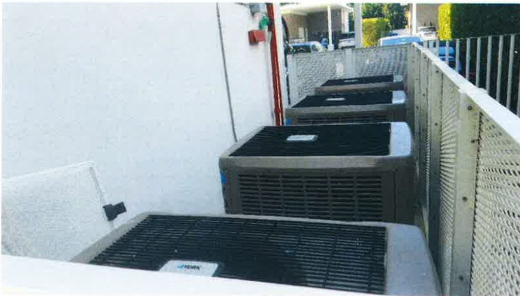
VILLA 1 – A/C ON NORTH SIDE 2-20-2019