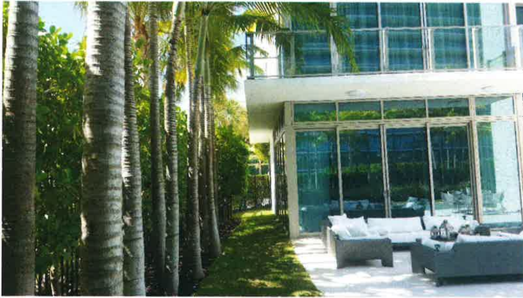
VILLA 1 – SOUTH LOOKING WEST 2-20-2019

If submitting more photographs than will fit on the preceding page, affix the additional photographs below. Identify all photographs with: date taken; "Front View" and "Rear View"; and, if required, "Right Side View" and "Left Side View." When applicable, photographs must show the foundation with representative examples of the flood openings or vents, as indicated in Section A8.