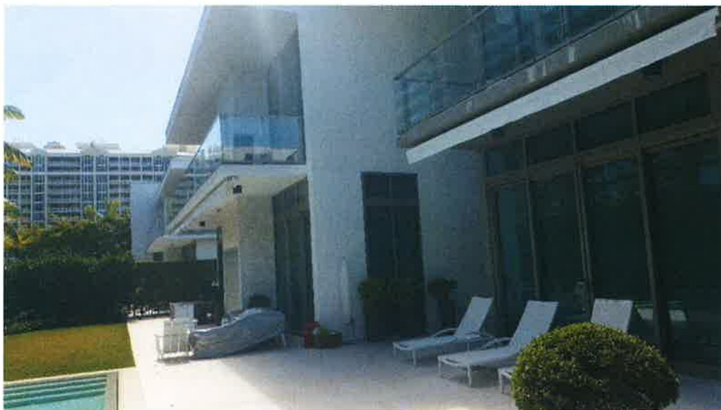
VILLA 2 – EAST SIDE LOOKING SOUTH 2-20-2019