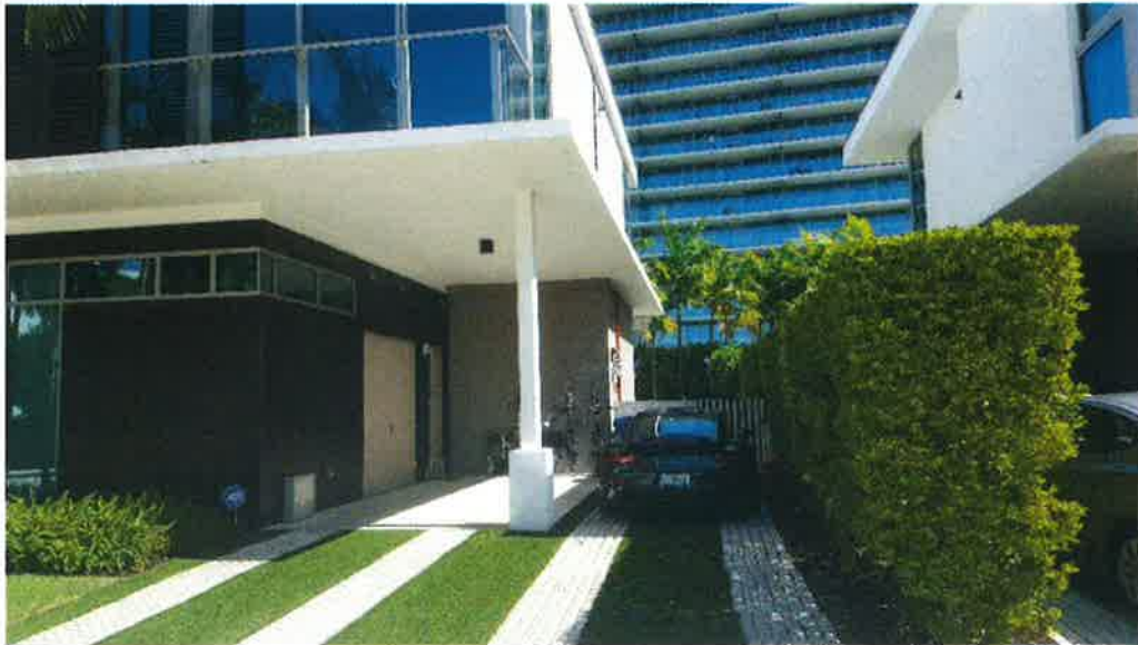
VILLA 2 – SOUTH SIDE LOOKING EAST 2-20-2109

If using the Elevation Certificate to obtain NFIP flood insurance, affix at least 2 building photographs below according to the instructions for Item A6. Identify all photographs with date taken; "Front View" and "Rear View"; and, if required, "Right Side View" and "Left Side View." When applicable, photographs must show the foundation with representative examples of the flood openings or vents, as indicated in Section A8. If submitting more photographs than will fit on this page, use the Continuation Page.