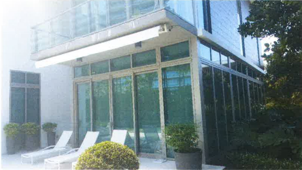
VILLA 2 – NORTHEAST CORNER LOOKING WEST 2-20-2019

If submitting more photographs than will fit on the preceding page, affix the additional photographs below. Identify all photographs with: date taken; "Front View" and "Rear View"; and, if required, "Right Side View" and "Left Side View." When applicable, photographs must show the foundation with representative examples of the flood openings or vents, as indicated in Section A8.