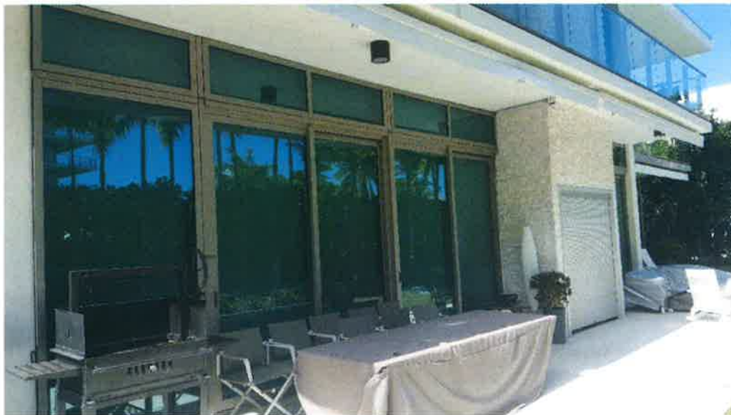
VILLA 2 – EAST SIDE LOOKING NORTH 2-20-2019