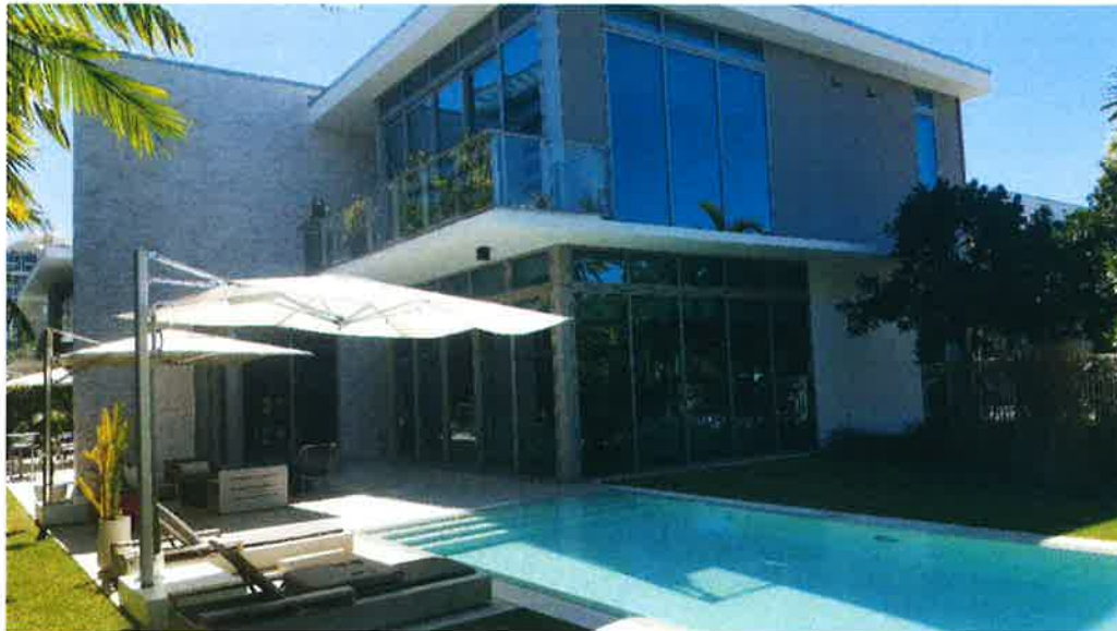
VILLA 4 – NORTH SIDE LOOKING SOUTHWEST 2-20-2019