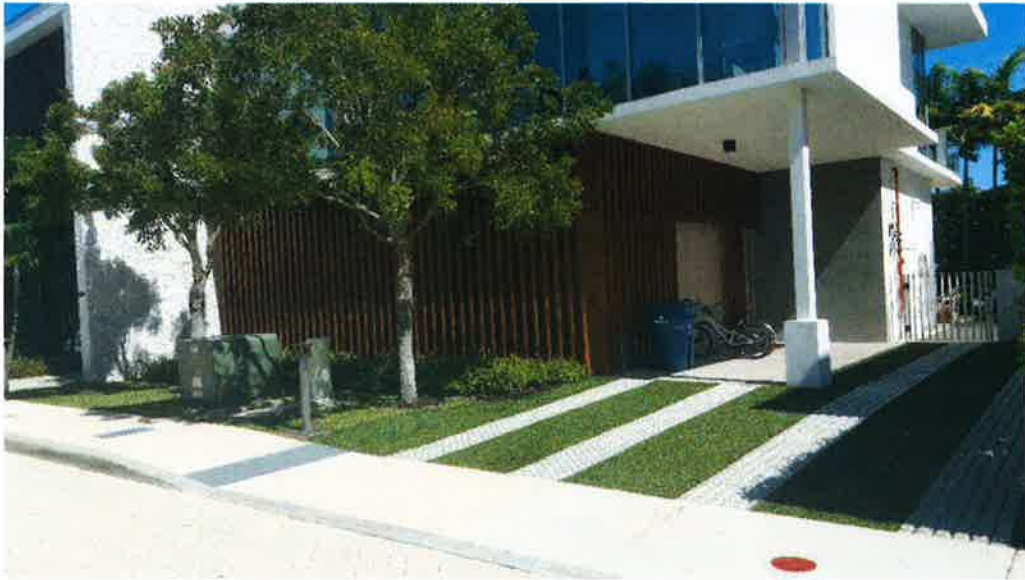
VILLA 4 – SOUTHWEST CORNER LOOKING EAST 2-20-2019

If using the Elevation Certificate to obtain NFIP flood insurance, affix at least 2 building photographs below according to the instructions for Item A6. Identify all photographs with date taken; "Front View" and "Rear View"; and, if required, "Right Side View" and "Left Side View." When applicable, photographs must show the foundation with representative examples of the flood openings or vents, as indicated in Section A8. If submitting more photographs than will fit on this page, use the Continuation Page.