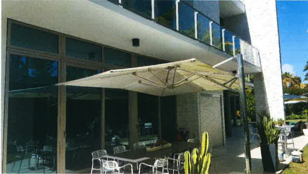
VILLA 4 – EAST SIDE LOOKING NORTH 2-20-2019

If submitting more photographs than will fit on the preceding page, affix the additional photographs below. Identify all photographs with: date taken; "Front View" and "Rear View"; and, if required, "Right Side View" and "Left Side View." When applicable, photographs must show the foundation with representative examples of the flood openings or vents, as indicated in Section A8.