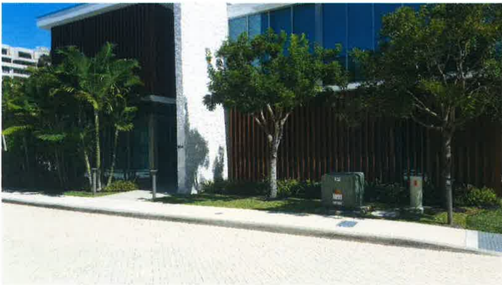
VILLA 4 – WEST SIDE 2-20-2019