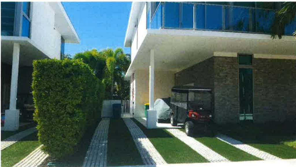
VILLA 6 – SOUTHEAST CORNER LOOKING WEST 2-20-2019