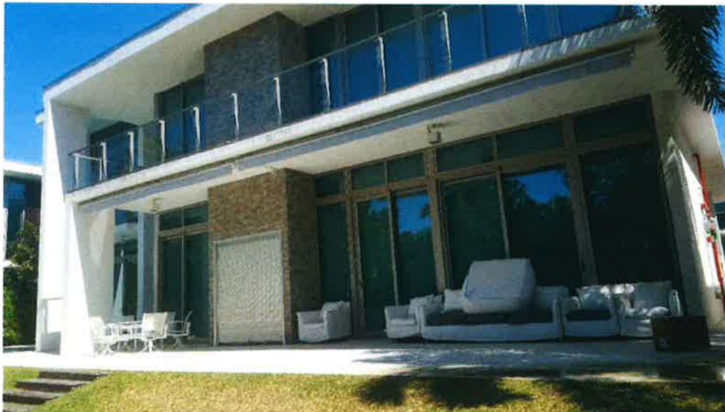
VILLA 6 – WEST SIDE LOOKING NORTH 2-20-2019