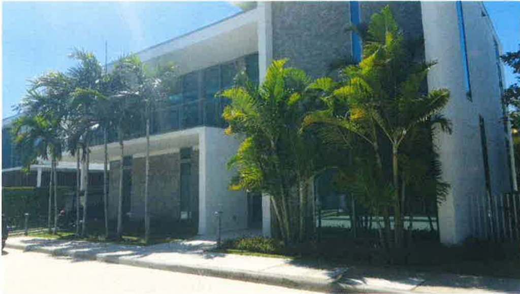
VILLA 6 – EAST SIDE LOOKING SOUTH 2-20-2019

If using the Elevation Certificate to obtain NFIP flood insurance, affix at least 2 building photographs below according to the instructions for Item A6. Identify all photographs with date taken; "Front View" and "Rear View"; and, if required, "Right Side View" and "Left Side View." When applicable, photographs must show the foundation with representative examples of the flood openings or vents, as indicated in Section A8. If submitting more photographs than will fit on this page, use the Continuation Page.