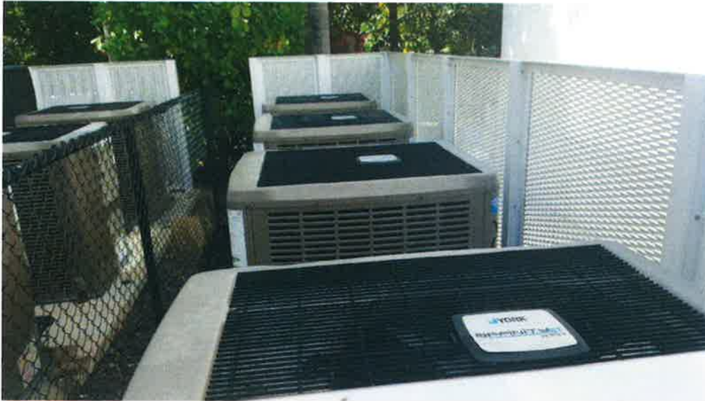
VILLA 6 – A/C ON SOUTH SIDE 2-20-2019

If submitting more photographs than will fit on the preceding page, affix the additional photographs below. Identify all photographs with: date taken; "Front View" and "Rear View"; and, if required, "Right Side View" and "Left Side View." When applicable, photographs must show the foundation with representative examples of the flood openings or vents, as indicated in Section A8.