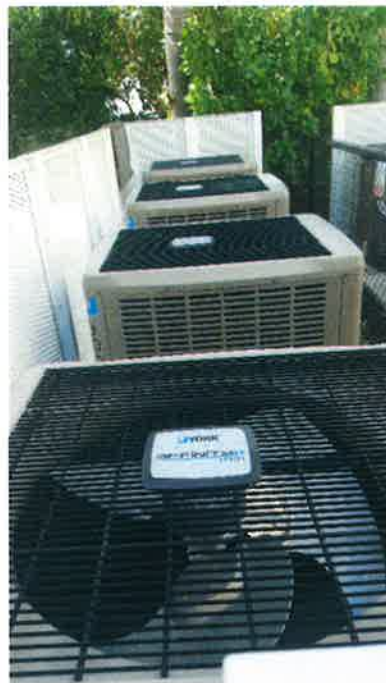
VILLA 7 – A/C ON NORTH SIDE 2-20-2019