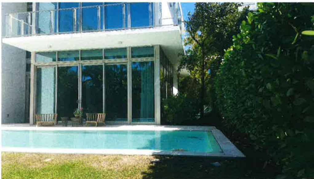
VILLA 7 – SOUTHWEST CORNER LOOKING NORTHEAST 2-20-2019