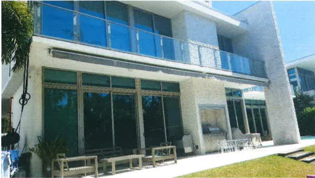
VILLA 7 – WEST SIDE LOOKING SOUTHEAST 2-20-2019

If submitting more photographs than will fit on the preceding page, affix the additional photographs below. Identify all photographs with: date taken; "Front View" and "Rear View"; and, if required, "Right Side View" and "Left Side View." When applicable, photographs must show the foundation with representative examples of the flood openings or vents, as indicated in Section A8.