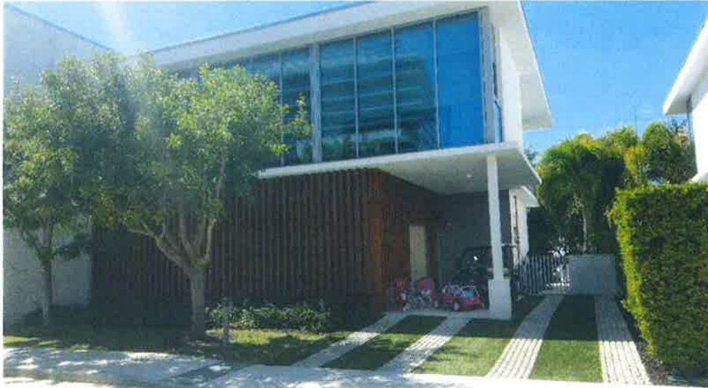
VILLA 7 – NORTHEAST CORNER LOOKING SOUTHWEST 2-20-2019

If using the Elevation Certificate to obtain NFIP flood insurance, affix at least 2 building photographs below according to the instructions for Item A6. Identify all photographs with date taken; "Front View" and "Rear View"; and, if required, "Right Side View" and "Left Side View." When applicable, photographs must show the foundation with representative examples of the flood openings or vents, as indicated in Section A8. If submitting more photographs than will fit on this page, use the Continuation Page.