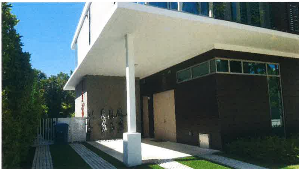
VILLA 8 – SOUTHEAST CORNER LOOKING WEST 2-20-2019