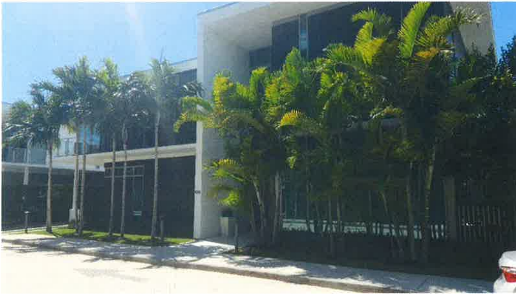
VILLA 8 – EAST SIDE LOOKING SOUTH 2-20-2019

If using the Elevation Certificate to obtain NFIP flood insurance, affix at least 2 building photographs below according to the instructions for Item A6. Identify all photographs with date taken; "Front View" and "Rear View"; and, if required, "Right Side View" and "Left Side View." When applicable, photographs must show the foundation with representative examples of the flood openings or vents, as indicated in Section A8. If submitting more photographs than will fit on this page, use the Continuation Page.