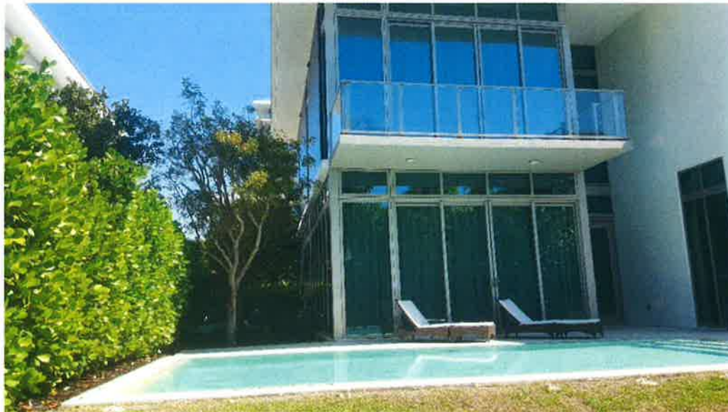
VILLA 8 – NORTHWEST CORNER LOOKING EAST 2-20-2019