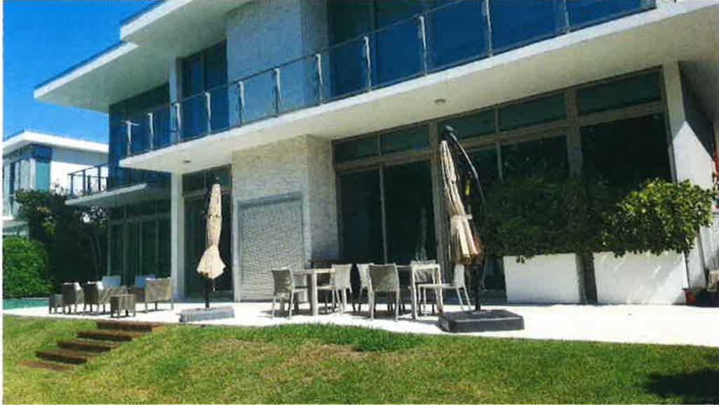
VILLA 8 – WEST SIDE LOOKING NORTH 2-20-2019

If submitting more photographs than will fit on the preceding page, affix the additional photographs below. Identify all photographs with: date taken; "Front View" and "Rear View"; and, if required, "Right Side View" and "Left Side View." When applicable, photographs must show the foundation with representative examples of the flood openings or vents, as indicated in Section A8.