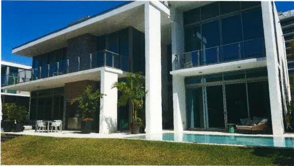
VILLA 9 – WEST SIDE NORTHEAST 2-20-2019

If submitting more photographs than will fit on the preceding page, affix the additional photographs below. Identify all photographs with: date taken; "Front View" and "Rear View"; and, if required, "Right Side View" and "Left Side View." When applicable, photographs must show the foundation with representative examples of the flood openings or vents, as indicated in Section A8.