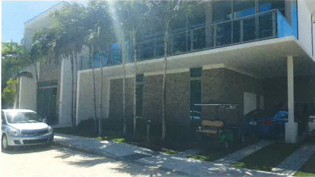
VILLA 9 – NORTHEAST CORNER LOOKING SOUTHWEST 2-20-2019

If using the Elevation Certificate to obtain NFIP flood insurance, affix at least 2 building photographs below according to the instructions for Item A6. Identify all photographs with date taken; "Front View" and "Rear View"; and, if required, "Right Side View" and "Left Side View." When applicable, photographs must show the foundation with representative examples of the flood openings or vents, as indicated in Section A8. If submitting more photographs than will fit on this page, use the Continuation Page.