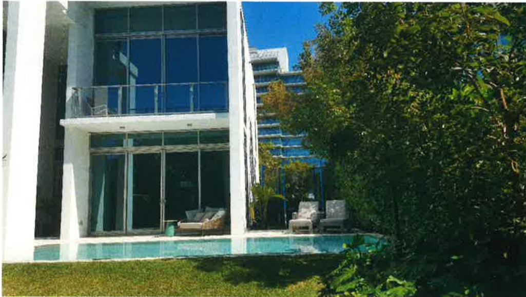
VILLA 9 – SOUTH SIDE LOOKING EAST 2-20-2019