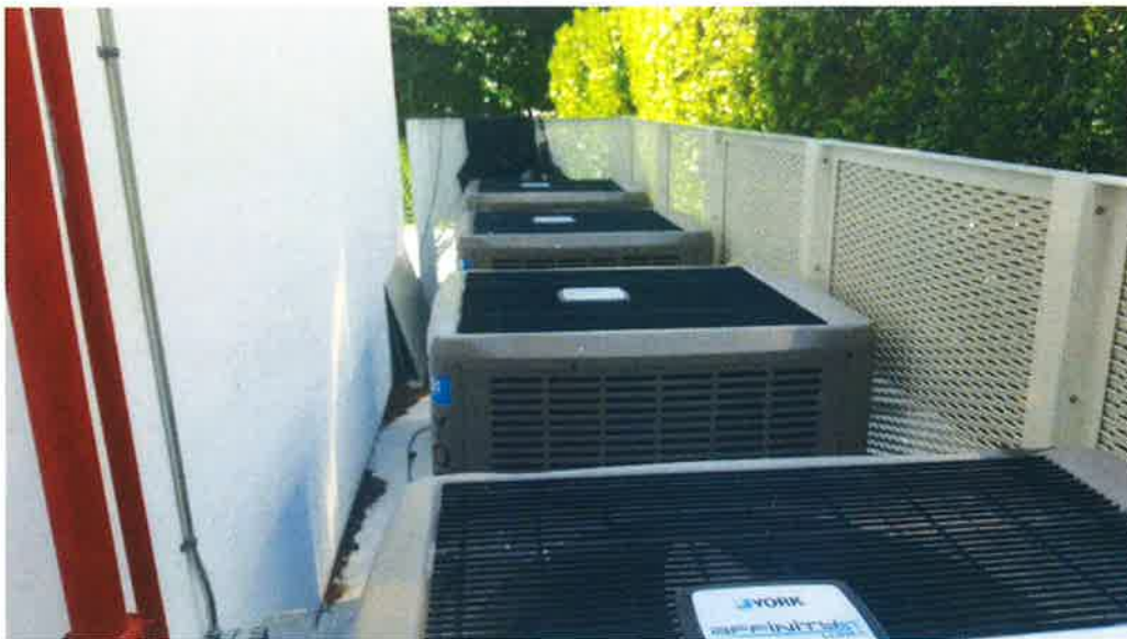
VILLA 9 – A/C ON NORTH SIDE 2-20-2019