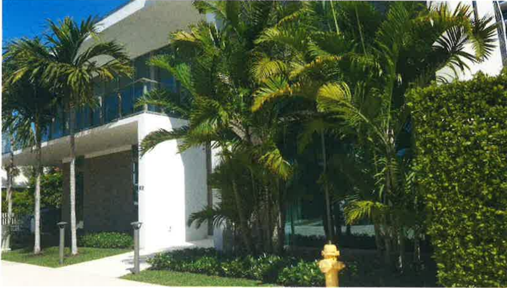
VILLA 12 – WEST SIDE LOOKING NORTH 2-20-2019

If using the Elevation Certificate to obtain NFIP flood insurance, affix at least 2 building photographs below according to the instructions for Item A6. Identify all photographs with date taken; "Front View" and "Rear View"; and, if required, "Right Side View" and "Left Side View." When applicable, photographs must show the foundation with representative examples of the flood openings or vents, as indicated in Section A8. If submitting more photographs than will fit on this page, use the Continuation Page.