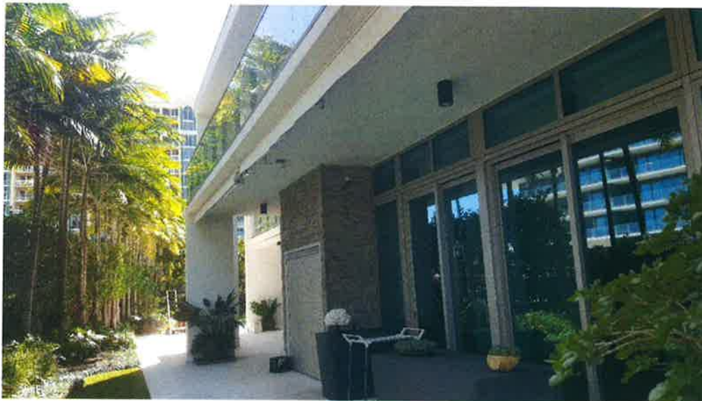
VILLA 12 – EAST SIDE LOOKING NORTH 2-20-2019