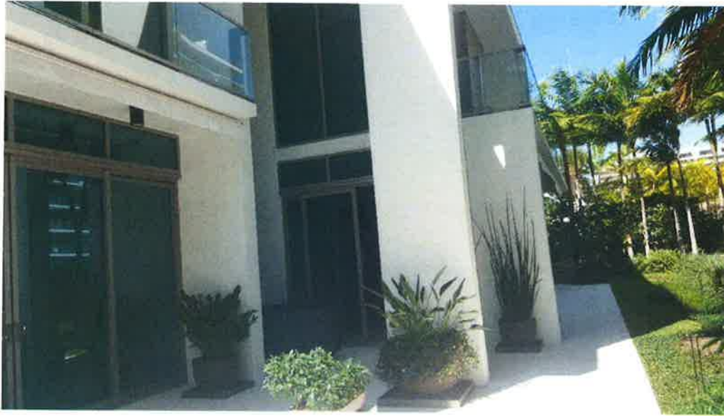
VILLA 12 – EAST SIDE LOOKING SOUTH 2-20-2019

If submitting more photographs than will fit on the preceding page, affix the additional photographs below. Identify all photographs with: date taken; "Front View" and "Rear View"; and, if required, "Right Side View" and "Left Side View." When applicable, photographs must show the foundation with representative examples of the flood openings or vents, as indicated in Section A8.