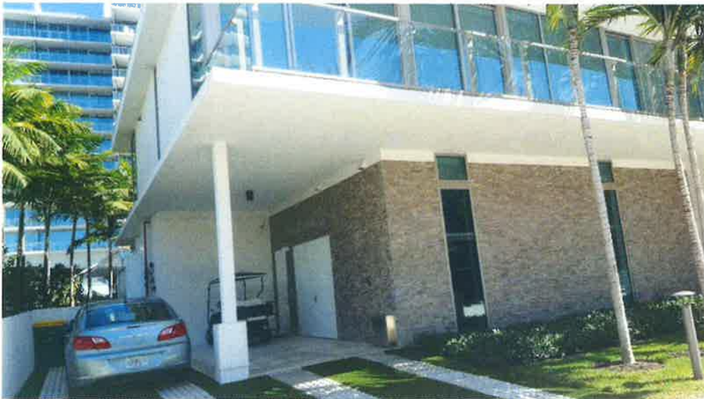
VILLA 12 – NORTH SIDE LOOKING EAST 2-20-2019