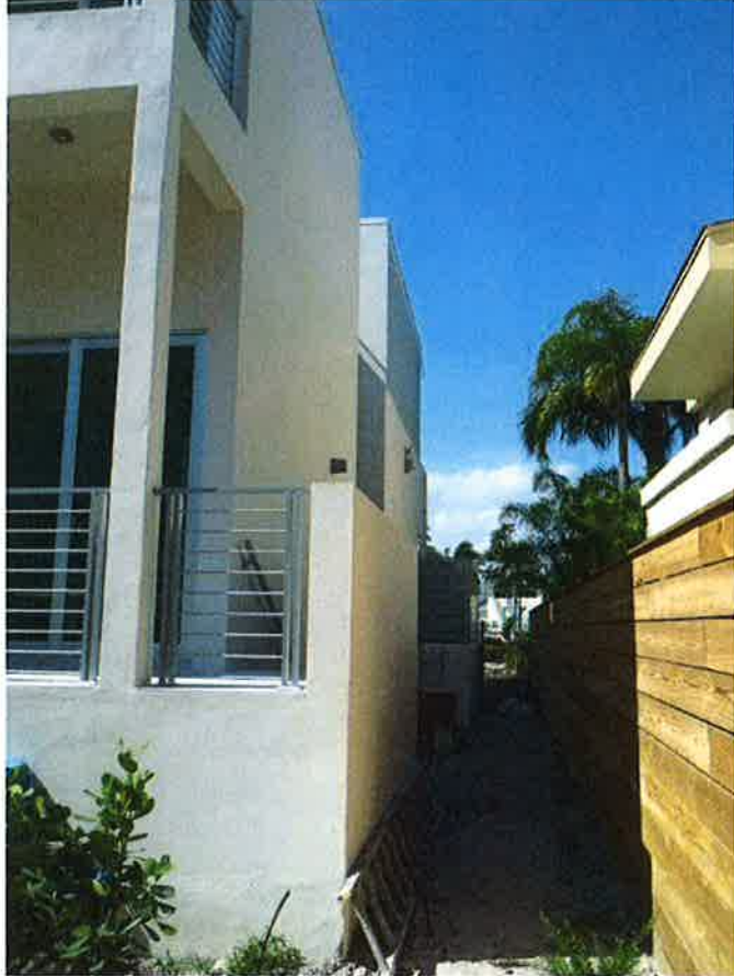
LEFT SIDE VIEW 02/26/14