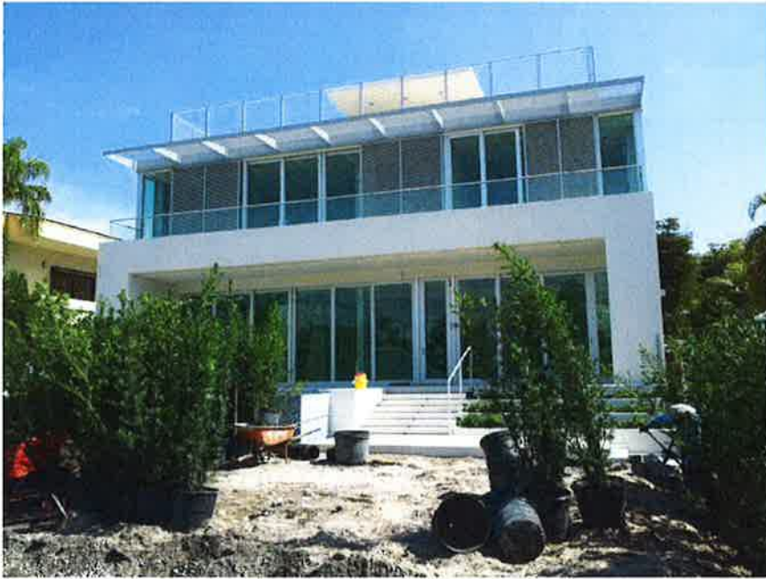
FRONT VIEW 02/26/2014

If using the Elevation Certificate to obtain NFIP flood insurance, affix at least 2 building photographs below according to the instructions for Item A6. Identify all photographs with date taken; "Front View" and "Rear View"; and, if required, "Right Side View" and "Left Side View." When applicable, photographs must show the foundation with representative examples of the flood openings or vents, as indicated in Section A8. If submitting more photographs than will fit on this page, use the Continuation Page.