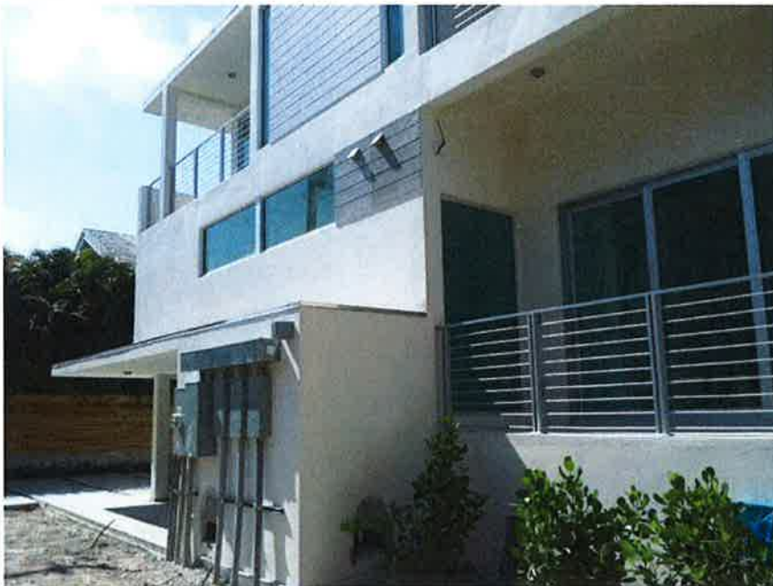
BACK VIEW 02/26/2014