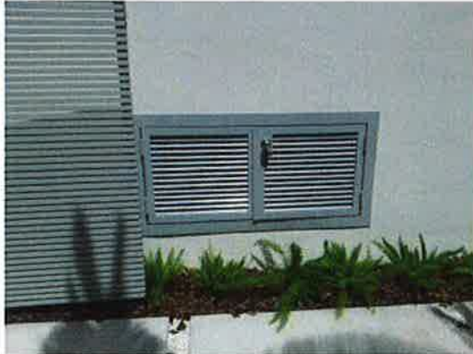
VENT PICTURES 04/07/14

Handwritten blue mark resembling a stylized 'A' or 'B'.