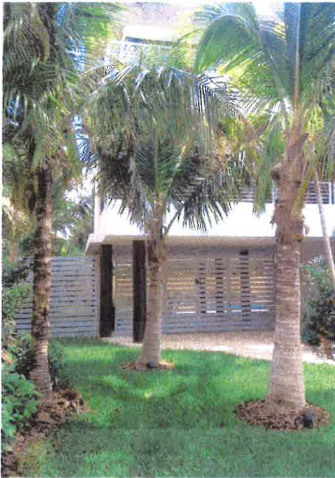
PHOTOS TAKEN ON 04-22-2014 FRONT VIEW

If using the Elevation Certificate to obtain NFIP flood insurance, affix at least 2 building photographs below according to the instructions for Item A6. Identify all photographs with date taken; "Front View" and "Rear View"; and, if required, "Right Side View" and "Left Side View." When applicable, photographs must show the foundation with representative examples of the flood openings or vents, as indicated in Section A8. If submitting more photographs than will fit on this page, use the Continuation Page.