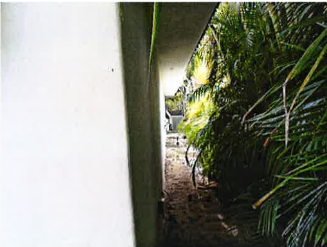
RIGHT SIDE VIEW 07-26-2014