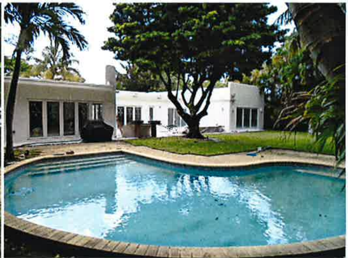
REAR VIEW 07-26-2014