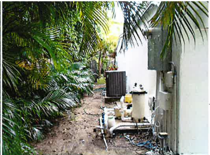
LEFT SIDE VIEW 07-26-2014