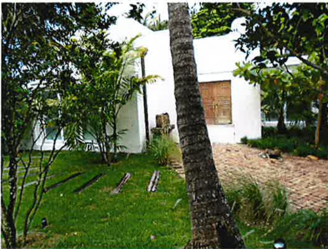
FRONT VIEW 07-26-2014

If using the Elevation Certificate to obtain NFIP flood insurance, affix at least 2 building photographs below according to the instructions for Item A6. Identify all photographs with date taken; "Front View" and "Rear View"; and, if required, "Right Side View" and "Left Side View." When applicable, photographs must show the foundation with representative examples of the flood openings or vents, as indicated in Section A8. If submitting more photographs than will fit on this page, use the Continuation Page.