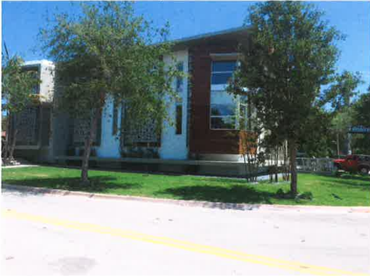
FRONT VIEW MARCH 17, 2015

If using the Elevation Certificate to obtain NFIP flood insurance, affix at least 2 building photographs below according to the instructions for Item A6. Identify all photographs with date taken; "Front View" and "Rear View"; and, if required, "Right Side View" and "Left Side View." When applicable, photographs must show the foundation with representative examples of the flood openings or vents, as indicated in Section A8. If submitting more photographs than will fit on this page, use the Continuation Page.