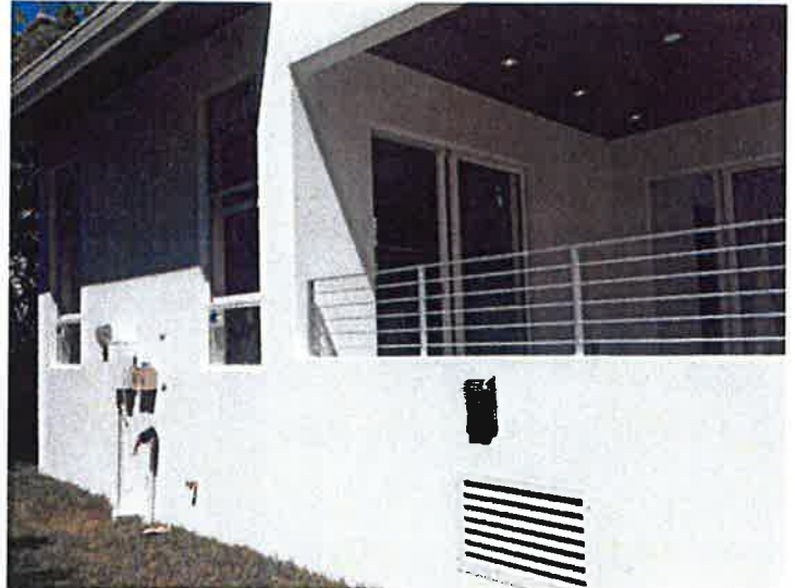
Rear View: 09/02/2015