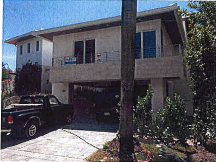
Front View: 09/02/2015