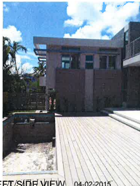
LEFT SIDE VIEW 04-02-2015