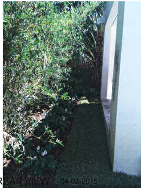
REAR VIEW 04-02-2015