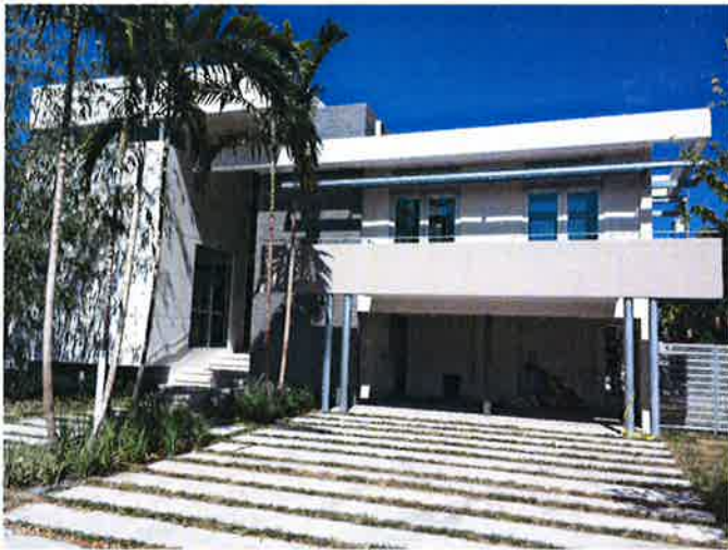
FRONT VIEW 04-02-2015

If using the Elevation Certificate to obtain NFIP flood insurance, affix at least 2 building photographs below according to the instructions for Item A6. Identify all photographs with date taken; "Front View" and "Rear View"; and, if required, "Right Side View" and "Left Side View." When applicable, photographs must show the foundation with representative examples of the flood openings or vents, as indicated in Section A8. If submitting more photographs than will fit on this page, use the Continuation Page.