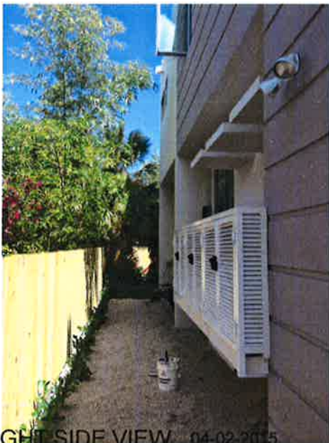
RIGHT SIDE VIEW 04-02-2015