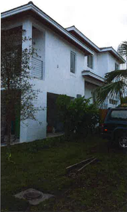
RIGHT SIDE VIEW 11/25/14

If submitting more photographs than will fit on the preceding page, affix the additional photographs below. Identify all photographs with: date taken; "Front View" and "Rear View"; and, if required, "Right Side View" and "Left Side View." When applicable, photographs must show the foundation with representative examples of the flood openings or vents, as indicated in Section A8.