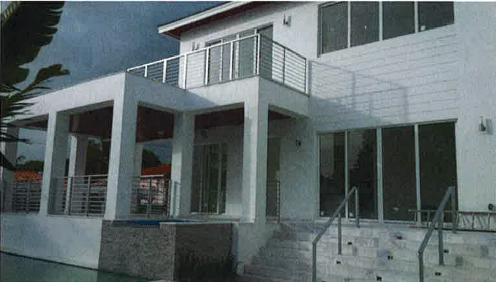
BACK VIEW 11/25/14