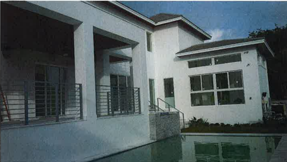
LEFT SIDE VIEW 11/25/14