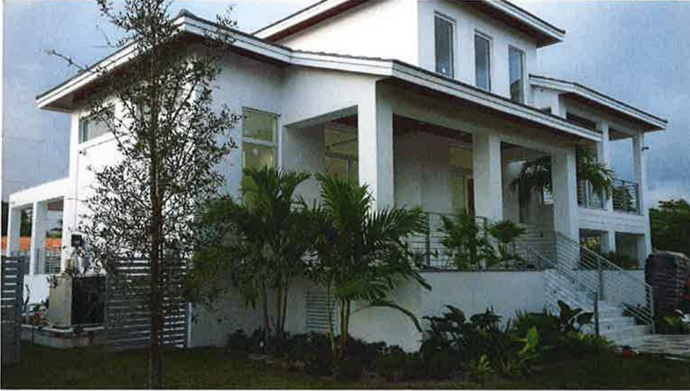
FRONT VIEW 11/25/14

If using the Elevation Certificate to obtain NFIP flood insurance, affix at least 2 building photographs below according to the instructions for Item A6. Identify all photographs with date taken; "Front View" and "Rear View"; and, if required, "Right Side View" and "Left Side View." When applicable, photographs must show the foundation with representative examples of the flood openings or vents, as indicated in Section A8. If submitting more photographs than will fit on this page, use the Continuation Page.