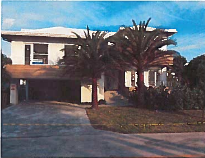
Front View: 01/06/2015