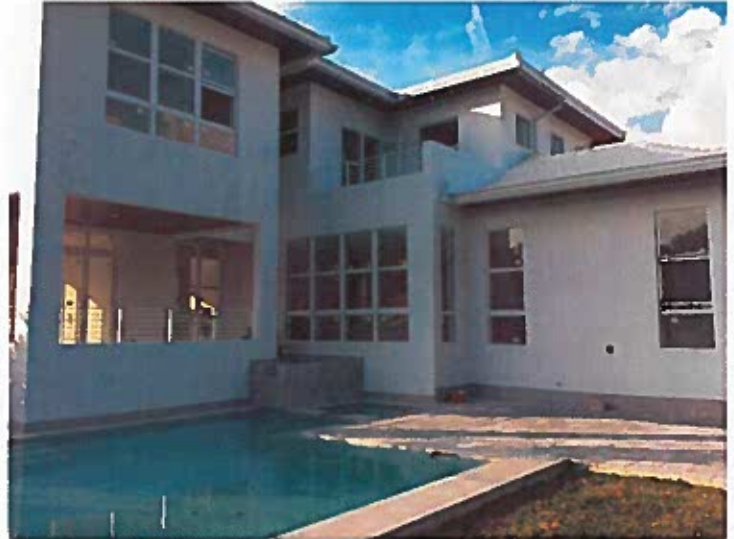
Rear View: 01/06/2015