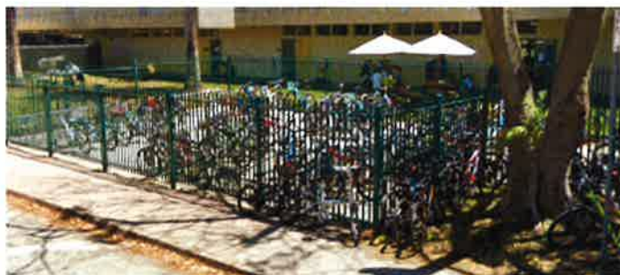
Existing Deficient Bike Parking/Storage

the combined efforts that the infrastructure improvements, as well as the enforcement recommendations made by the 2015 SRTS Study, prepared for this project there will be a significant improvement on viability for students to walk/bike safely to their school.