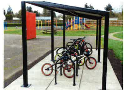
Sample Bike Racks

Much of Kimley-Horn's public sector work in Florida is provided for FDOT, and therefore, we have a thorough understanding of FDOT requirements and expectations. This knowledge, gained from many successful projects across the state, allows us to maintain, coordinate, and exchange information and achieve a high level of cooperation and communication. This includes understanding and working within the requirements of the Local Agency Program (LAP). Kimley-Horn is currently working with several municipalities such as Miami-Dade County, Miami Lakes, Miami