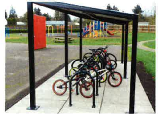
Sample Bike Racks

Much of Kimley-Horn's public sector work in Florida is provided for FDOT, and therefore, we have a thorough understanding of FDOT requirements and expectations. This knowledge, gained from many successful projects across the state, allows us to maintain, coordinate, and exchange information and achieve a high level of cooperation and communication. This includes understanding and working within the requirements of the Local Agency Program (LAP). Kimley-Horn is currently working with several municipalities such as Miami-Dade County, Miami Lakes, Miami