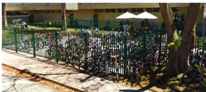
Existing Deficient Bike Parking/Storage

the combined efforts that the infrastructure improvements, as well as the enforcement recommendations made by the 2015 SRTS Study, prepared for this project there will be a significant improvement on viability for students to walk/bike safely to their school.