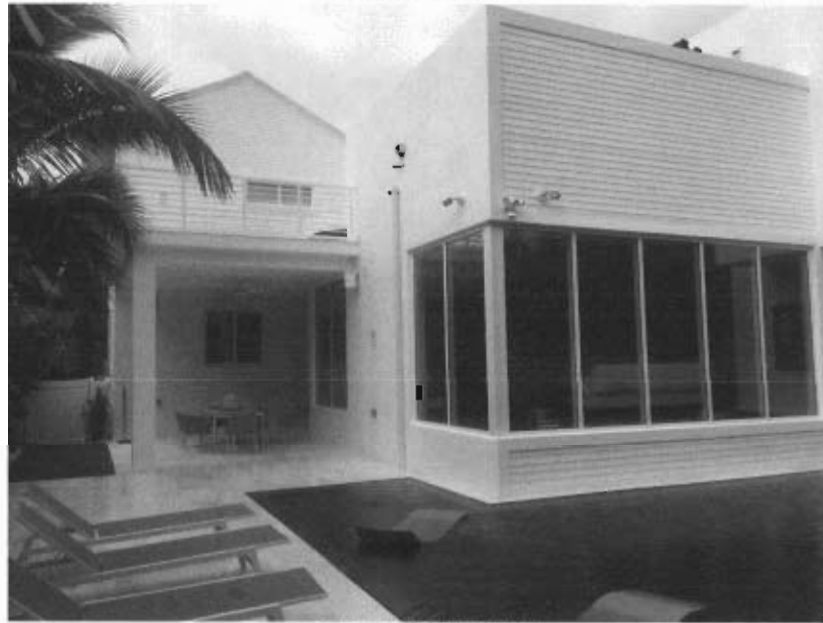
REAR SIDE VIEW